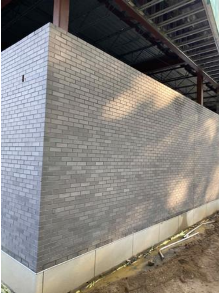
July 2021 Construction Report