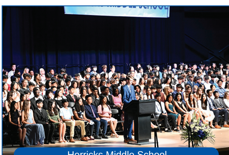
Herricks Middle School