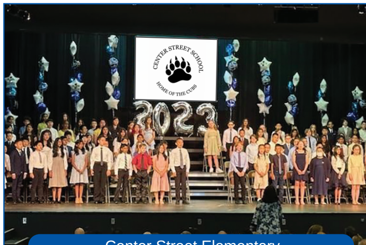
Center Street Elementary

Congratulations to all fifth and eighth grade students throughout the district who celebrated their moving-up ceremonies in June. Each ceremony included student reflections, inspirational words of wisdom from administrators and special guests and poignant musical selections. Concluding each ceremony, students were individually recognized to the applause of all in attendance. We wish our fifth and eighth grade students much success as they begin their next steps in Herricks!