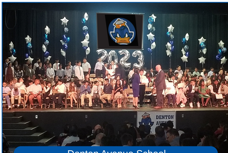
Denton Avenue School